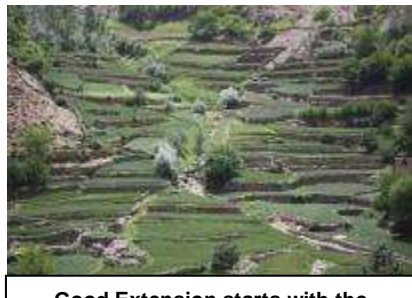
Good Extension starts with the Audience and their needs

The framework requires interaction, with evaluation throughout the entire process. Each element is defined below.